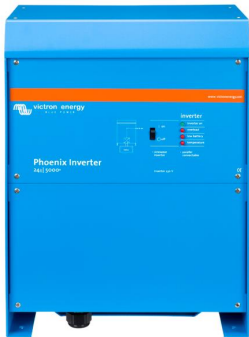
Phoenix Inverter 24/5000